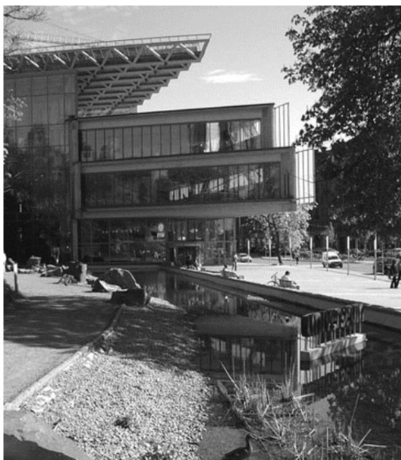
Figure 1. Universeum, the entrance and the water mirror of locally treated storm water.

The building consists of a collage of parts with different expressions: The 'wooden barn' containing the science centre part with its expressive sawtooth roof prepared for solar-cells, the triangular glassed rain forest between the 'wooden barn' and the 'stone coffin' which in turn contains the aquariums cut into the cliff using the blasted stone as façade material in stone 'gabions', leading over to the 'Swedish landscape' under a transparent roof of plastic (Fig. 1).