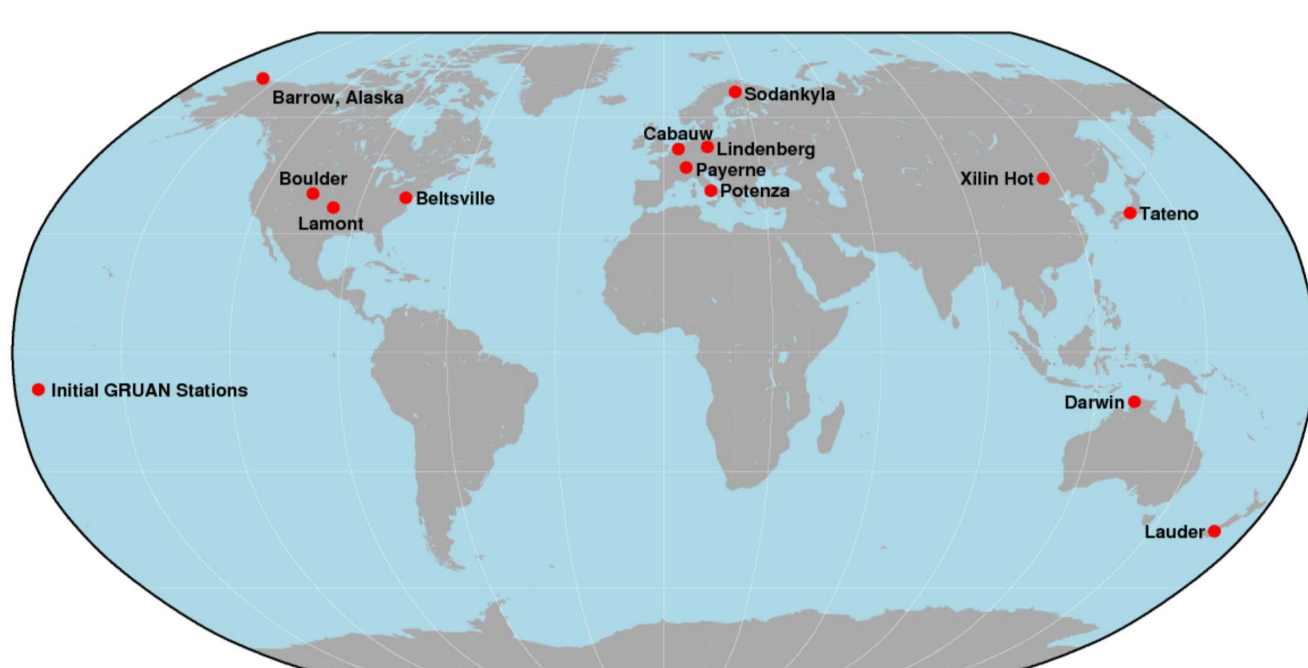
Figure 1: The GRUAN network, initial sites.