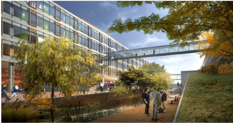
Fig. 5. The new Karolinska hospital, Stockholm (White Architects)

Redevelopment was also deemed to be too expensive, with an estimated cost of SEK 7 billion (€650 million) over 10 years (Stockholm County Council 2004), relative to the functionality of the refurbished site and by comparison with a new build. Constructing a new hospital was therefore considered to be more cost effective compared to renovating and refurbishing.