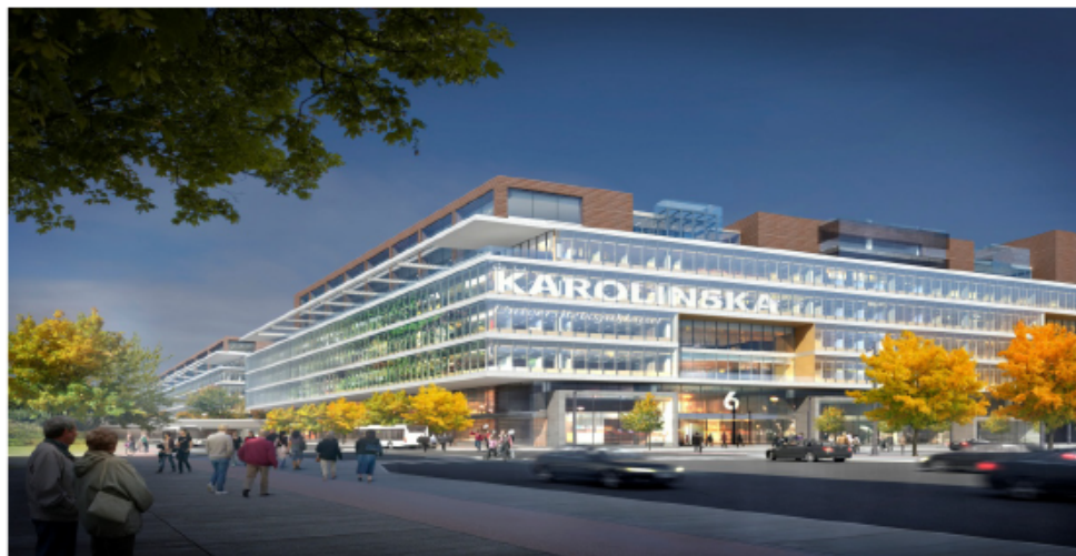
Fig. 4. The new Karolinska hospital, Stockholm (White Architects)

A number of reports and decisions from 2001 and onwards established the need for a new university hospital, to replace the present Karolinska University Hospital in Stockholm. The question was Why should Karolinska Solna be replaced rather than be refurbished? The review of the existing property stock of Karolinska Solna was unequivocal: the hospital was spread over a large area with 40 buildings, with weak connections and logistics. Furthermore, many buildings were old, outdated and unsuitable for the provision of modern hospital services.