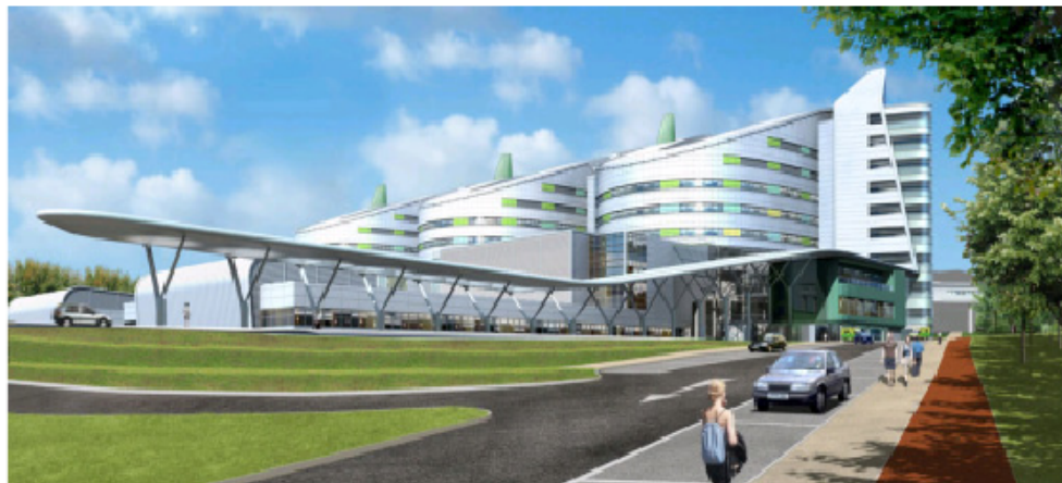
Fig. 3. Queen Elizabeth Hospital Birmingham (BDP Architects)

From 1990s onwards the centralisation approach brought in PFI (Private Finance Initiative) justified on ideological grounds that the private sector is better at delivering services than the public sector. The programme introduced the building of over 75 healthcare projects in the UK as a whole. Figure 3 provides an example. The global financial crisis which began in 2007 presents PFI with difficulties because many sources of private capital have dried up leaving central government to fund the so-called 'private' finance initiatives itself.