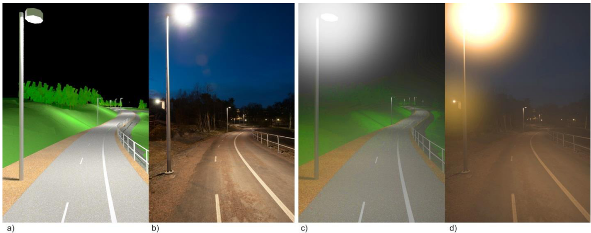
Fig. 2a) CAD model with light rendering of a pathway section. b) Real photo from the same location as in a. c-d) Visualization of contrast reduction due to veiling luminance of the scenes a and b.

The scene was a walkway with streetlights on poles. The development of the CAD model started with a 3D vector model of the ground topography taken from a geographic information system (GIS) database. This model was then processed in Sketchup Pro where material properties were added to the surfaces. This model was then transferred to Relux Pro where luminaires and other objects were added. The light rendering in Relux Pro uses both “raytracing” and “radiosity” techniques, which ensures that both reflected light from surfaces and direct light towards the observer are taken into account. The result is shown in Fig. 2a.