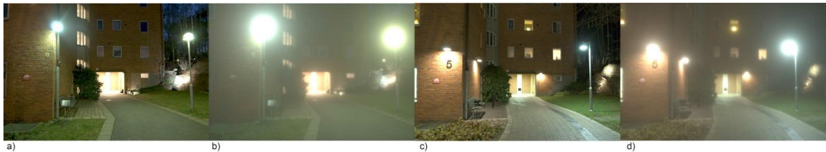
Fig 3a. Original lighting setting. b) Visualization of veiling luminance added to scene 3a. c) New lighting setting with less spill light and reduced risk for disability glare. d) Visualization of veiling luminance added to scene 3c.

In an outdoor lighting design study of a walkway outside an apartment building, we analysed the veiling luminance contribution in some scenes with simulations based on the eye model described in [10]. We found that the visibility was reduced to such an extent that some people might have problems to navigate. The lighting quality was improved by changing to luminaires that emitted less spill light and illuminated the ground more efficiently. These changes reduced the risk for disability glare which was proven by contrast measurements and glare simulations.