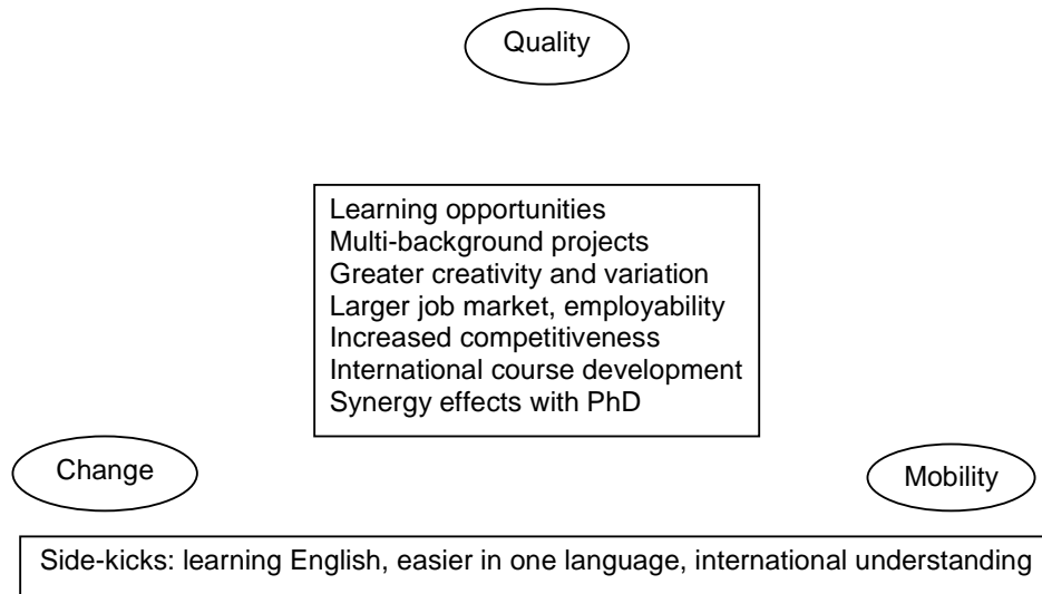
Figure 2. Schematised summary of the results from the focused task of formulating positive dimensions and challenges of delivering MSc programmes in English.

The four rhombuses that resulted from this task emphasised three dimensions of the reform, namely quality, mobility, and change (Fig. 2). Within the overlapping fields of these three dimensions, the rhombuses showed similarities which stressed the development of better learning environments in various ways. On the whole, deputy heads of departments looked to the benefits of internationalization through teaching in English and pointed at how they expected to see quality enhancement as a result of international learning environments, international exchange or collaboration. They also agreed that improved mobility for students as well as the teachers was a marked advantage and that this mobility promised a greater recruitment area also for PhD-programmes. To the extent that the language aspect was emphasized at all in this exercise, it was seen as one of the synergy effects of the reform i.e. that students would also improve their English.