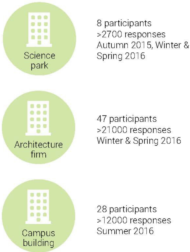
Figure 3. Pilot studies.

e.g. the required levels of concentration, stimulation or privacy.