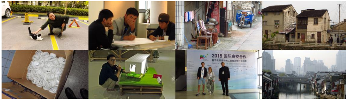
Figure 1: Upcycling workshops in China

done in this case without a ‘client’, resulting in the concepts not being developed further nor taken into production.