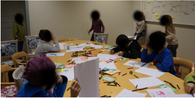
Figure 2. Children drawing and acting out their characters

The learning goals of this session for the children were defined to be to: get a feeling on how it is to be a designer, as their ideas would influence the final design; practice expressing their ideas through nonverbal means, as they would express through drawings and acting; communicate with classmates and improve collective decision-making, as everyone was collaborating for a common goal. These goals were presented to the children in a way that assured them that their expertise in being children was vital for the success of the design, and that without their participation, the design process would not be possible to carry out. As a reward for their help, a certificate that emphasized their contributions as designers was awarded to them.