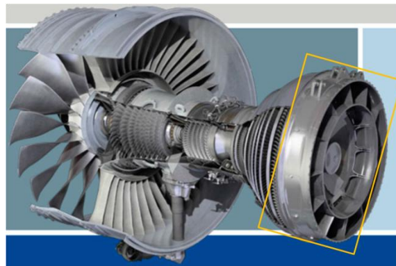
Figure 1 location of a TRS in a Trent 1000 engine (Rolls-Royce plc, 2014)

A turbine rear structure is a static structure situated at the rear end of the engine. It is included as a part of the Low Pressure Turbine (LPT) module. GKN Aerospace designs and manufactures TRSs for various engine OEMs. The TRS has the main functions of de-swirling the exit core flow from the LPT on its passage towards the nozzle. It also has mounting points for the engine to the nacelle. A representative figure of the turbine rear structure is shown in Figure 1.