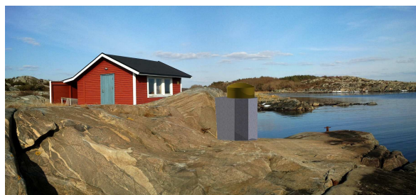
Fig. 3 An artist's impression of the future SMHI tide gauge station at the Onsala Space Observatory.

We signed a contract with SMHI to install an official SMHI tide gauge station at the observatory. This new tide gauge will have several sensors, e.g. one radar and two bubbler sensors for the sea-level observations. In addition these data will be complemented by several temperature and salinity sensors. Figure 3 depicts an artist's impression of this planned tide gauge site.