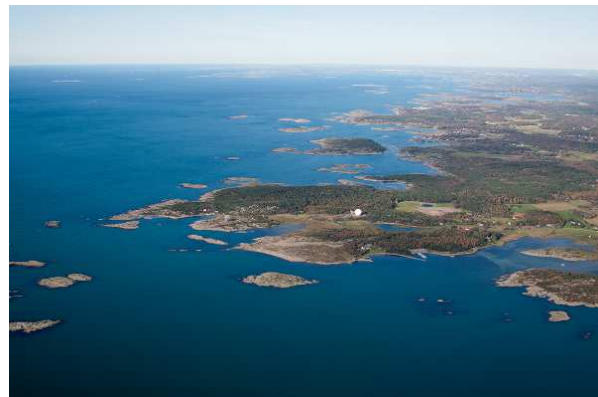
Fig. 1 An aerial photo of Råö with the Onsala Space Observatory. The white spot approximately in the center of the photo is the 30-m diameter radome that encloses the 20-m radio telescope which is used for geodetic VLBI observations.

burg. Onsala belongs to the municipality of Kungälv. Figure 1 shows an aerial photo of Råö.