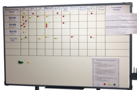
Fig. 1. pulse board