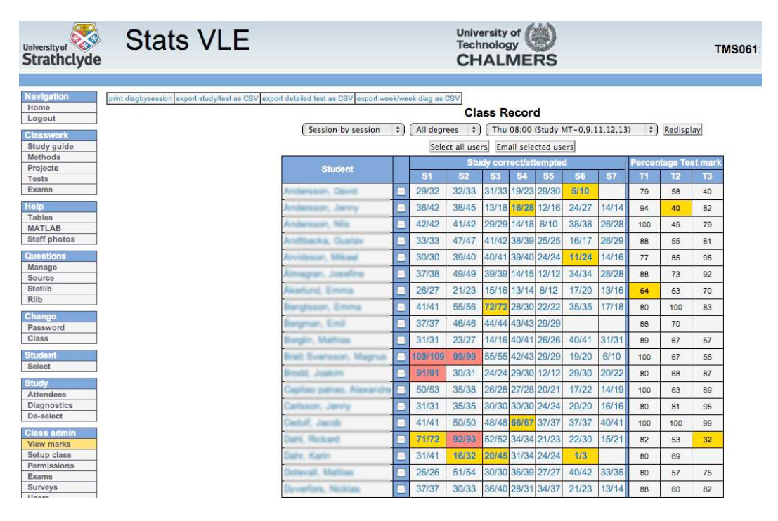
Figure 3: VLE adminstrator view.

Another feature of VLE is that it provides teachers with an administrative tool for communication, documentation, timetabling, diagnostics, surveys and monitoring each student's activity in the VLE. Each problem tried can be examined for errors which allows for individual support, see example of the activity log in Figure 3.