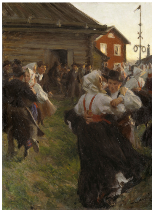
Figure 6. Anders Zorn (1860–1920): Midsommardans (“Midsummer Dance”), 1897, oil on canvas, 140 cm × 98 cm, Nationalmuseum Stockholm, Public domain.

A special importance was placed in the Nordic countries on Midsummer celebration (“Midsommar”), at summer solstice. It was viewed by rural people often as the year’s second-most important celebration, after Christmas. Although its roots date back to pre-Christian traditions, the Midsummer celebration—just like celebration of St. Lucia’s day and many other modern holidays—only acquired its current form and became universally significant for the whole country in the late 19th century. This was partly the result of conscious efforts to construct a new national tradition (Frykman and Löfgren 1991). The great importance of the midsummer for creating a national identity can be explained by its combination of popular tradition and natural display: On the one hand it is a festival linked to a number of popular folk customs, such as dancing around the Midsummer Pole (“midsommarstång”) or May Pole, as portrayed in Anders Zorn’s famous “Midsommardans” (“Midsummer Dance”, 1897) (Figure 6). On the other hand, summer solstice, as the longest day of the year, is actually a day without night in the northern parts of Scandinavia. Through its annual recurrence, it not only serves as the basis for the ritual character of the festival, but also connects it with a cosmic or atavistic natural experience, the idea of a soulful nature. In both art and literature this is often continued in the parallel linking of inner psychological and external natural experience (Varnedoe 1982, pp. 18–19).