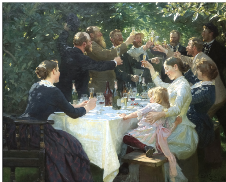
Figure 5. P.S. [Peder Severin] Krøyer (1851–1909): Hip, hip, hurra! Kunstnerfest på Skagen (“Hip, hip, hooray! Artists’ Celebration in Skagen”), 1884–1888, oil on canvas, 134.5 cm × 165.5 cm, Göteborgs Konstmuseum, Public domain.