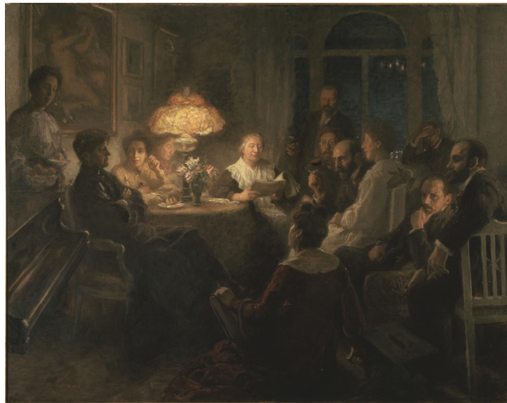
Figure 1. Hanna Pauli (1864–1940): Vännerna (“The Friends”), 1900–1907, oil on canvas, 204 cm × 260 cm, Nationalmuseum Stockholm, Public domain.

Ellen Key's writings, especially in Beauty for Everyone , in a manner similar to that expressed by other proponents of youth and reform movements (Berggren 1995, pp. 40–49; cf. Assmann 1989, pp. 243–46).