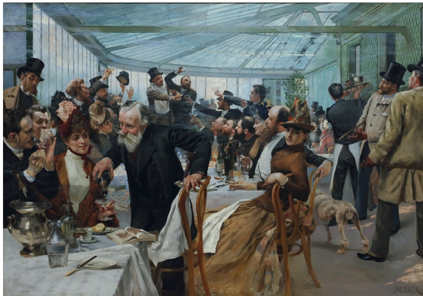
Figure 4. Hugo Birger (1854–1887): Skandinaviska konstnärernas frukost i Café Ledoyen, Paris fernissadagen 1886 (“Scandinavian Artists at Breakfast in Café Ledoyen on the day of the Paris Salon’s opening in 1886”), 1886, oil on canvas, 183.5 cm × 261.5 cm, Göteborgs Konstmuseum, Public domain.

to read not only the composition of the respective group at the time—each person represented was and still is known by name—but also of the relations between those portrayed. In addition, both portray the artists as established bourgeois groups. For example, Hugo Birger placed them on the opening day of the Paris Salon in a highly representative locale, i.e., the Café Ledoyen, one of the finest establishments in the French capital, between the Avenue des Champs-Élysées and the River Seine, at that time situated behind the Palais de l'Industrie (erected in 1855, demolished in 1897) and today located behind the Petit Palais, built in 1897–1900 (Arvidsson et al. 2014, pp. 150–53, 164–67).