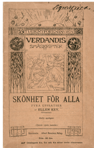
Figure 3. Ellen Key (1849–1926): Skönhet för Alla (“ Beauty for Everyone ”), Stockholm 1899. Cover by Carl Larsson (1853–1919).

Together with the three magazine articles published in 1891–1897: “Vardagsskönhet” (“Everyday Beauty”), “Festvanor” (“Festive Customs”) and “Skymningsbrasan” (“The Twilight Fire”) she presents a summary in the anthology Skönhet för Alla (“ Beauty for Everyone ”) (Key 1891, 1895, 1896, 1897b). This appeared in 1899 with a title page designed by Carl Larsson in the series of the radical Uppsala Student Association Verdandi published by her friend Albert Bonnier ((Key 1899); Figure 3).