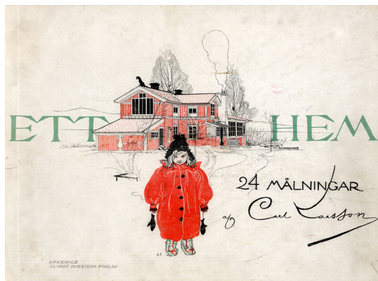
Figure 8. Carl Larsson (1853–1919): Ett hem (“A Home”), Stockholm, Albert Bonniers Forlag, 1899, cover.