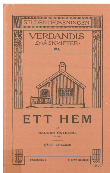
Figure 9. Ragnar Östberg (1866–1945): Ett Hem (“A Home”), Stockholm, Albert Bonniers Förlag, 1906, cover.

Ett Hem (“A Home”), an introduction to the building and furnishing of artistically designed country cottages (Östberg 1906; cf. Sheffield 1997, pp. 41–43) (Figure 9). They also influenced, for instance, the Skønvirke movement in Denmark, which arose at the beginning of the 20th century around Caspar Leuning Borch (1853–1910), Anton Rosen (1859–1928) and P.V. [Peder Vilhelm] Jensen Klint (1853–1930), which was situated between Art Nouveau and National Romanticism and became institutionalised in 1914 with the publication of a periodical with the same title. Finally, Ellen Key and Carl Larsson communicated extensively with the national romantic circle of the polar explorer Fridtjof Nansen (1861–1930), the painter Gerhard Munthe (1849–1929) and the young architect Arnstein Arneberg (1882–1961) in Lysaker in Norway (Lane 2000, pp. 79–89).