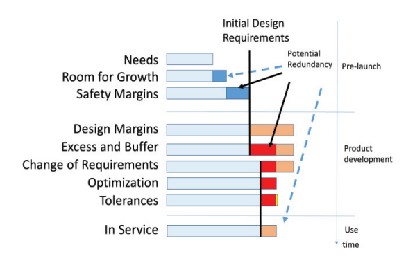
Figure 1 Margins in the design process