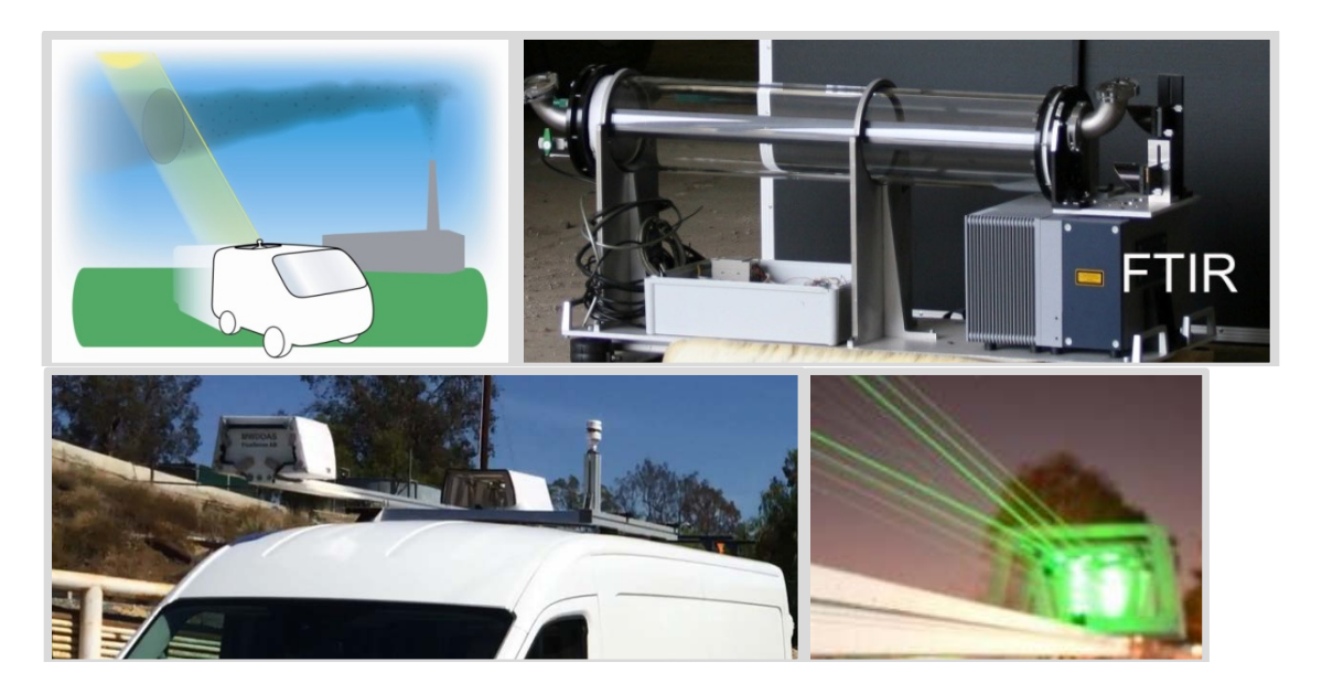
Figure 1. The methods used are shown here. From SOF measurements (upper left) the flux of alkanes are obtained. From extractive infrared absorption measurements (upper right) the concentration of alkanes, methane and other species including tracer gases on the ground is measured. From ultraviolet absorption measurements on the ground using an open path multi reflection cell the concentrations of aromatic VOCs are measured. The instrument is placed in a vehicle which is moved across the plume.

The column measurements using SOF were complemented by ground concentration measurements using multi-reflection absorption cells in the infrared of ultraviolet region (MeFTIR and Mobile White cell DOAS, respectively). Such extractive measurements have better speciation than the SOF measurements and by measuring the composition of various VOCs downwind the studied industries it is possible to infer emissions of more species than obtained by the SOF instrument alone, i.e. aromatic VOCs (BTEX) and methane. Here it is assumed that the ratio of BTEX versus alkanes that is measured on the ground represents the overall ratio in the emission plume. This may not be true, especially for the process area, and therefore the derived emission value is more uncertain.