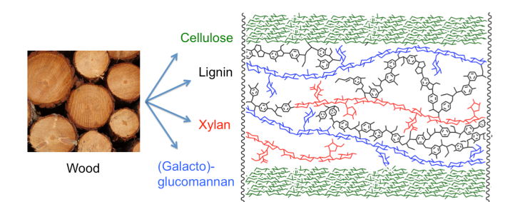
Figure 1. Schematic representation of secondary cell wall polymers in wood. For the general aim of WWSC, which is to generate new materials from trees, the efficient extraction of wood polymers is of great importance.

The overall aims of our study were to characterize new GE enzymes, to investigate their capacity in disconnecting hemicellulose from lignin and to apply them in the extraction process.