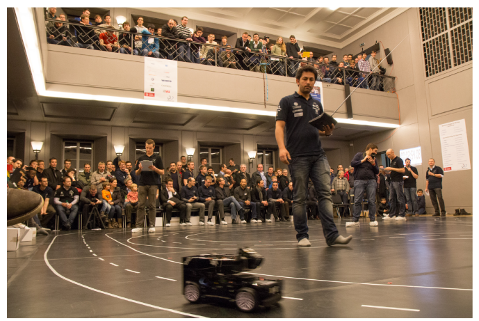
Figure 2. Driving in the discipline lane following.

c) Lane Following: The first dynamic discipline is to follow white lane markings on a black carpet as shown in Fig. 2. The track comprises of straight roads, arc-based curves, S-shaped curves, clothoid-based curves, intersections, and a parking strip.