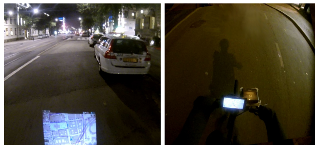
Figure 2. Images selected from experimental video recordings: projector (left) and mobile display (right).

We conducted an experiment comparing two conditions, each using GPS navigation while cycling: mobile phone display versus projection on the pavement in front of the bike. GPS map navigation is considered a skilled activity where users should support their navigation with the system and not follow instructions blindly [1]. Design choices are drawn from recent GPS navigation guidelines suggesting active drivers are “interpreting, ignoring, re-using instructions while also combining them with related information from the environment and their own route knowledge” [1]. Experiment leaders indicated start and finish for the four routes. Subjects cycled for over 20 minutes and had 20 minutes to complete a questionnaire. Recruits were required to be able to ride a bike. Novelty effect was addressed by choosing university students as subjects, having more routes, and providing subjects time to get them acquainted with the technology. These findings, together with the goal of designing for interaction in motion, led us to not have audio or turn-by-turn instructions in our study. Instead, subjects were instructed to identify their need to turn solely from visual information, given as a route and their location on it. We wanted subjects to be more aware of their surroundings in order to use their visuo-spatial ca-