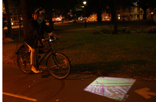
Figure 1. Driving a bike equipped with the Smart Flashlight.

http://dx.doi.org/10.1145/2556288.2557289