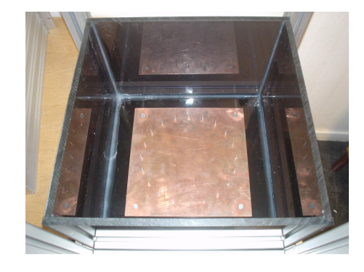
Figure 2: Photo of the imaging system. The 20 monopole antennas are mounted on a copper ground plane.